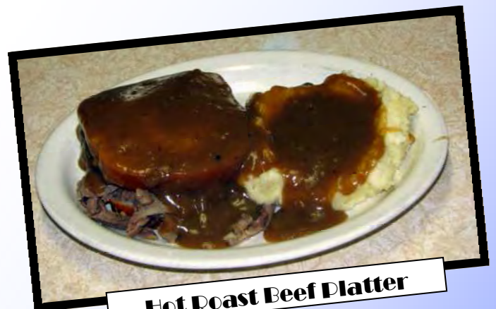
Hot Roast Beef Platter

Add American or Swiss cheese for .39 Pepper Jack for .59 Add tomatoes, grilled onions or mushrooms for .49 Add bacon for 1.39