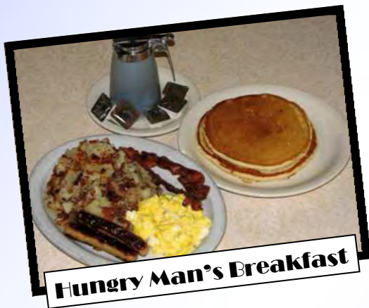
Hungry Man's Breakfast

*Steak & Eggs · 6 oz. USDA choice butterflied ball tip steak served with two eggs cooked any style, home fries, toast and Smucker's jelly. 8.69