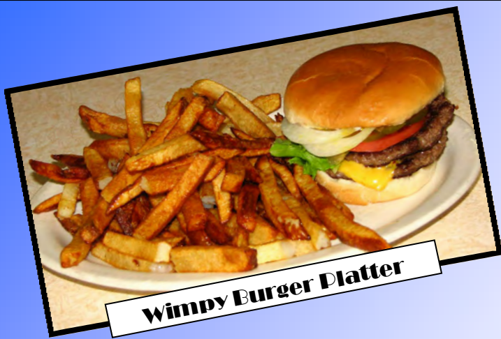
Wimpy Burger Platter