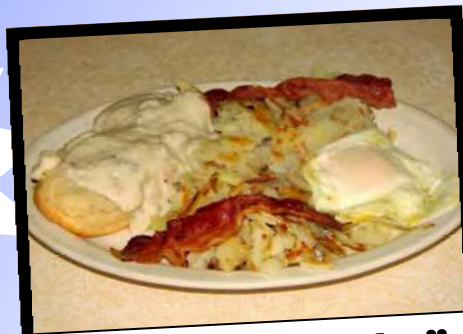
Sunrise Special "Plus"

Free Coffee or Tea with Breakfast Entrée!