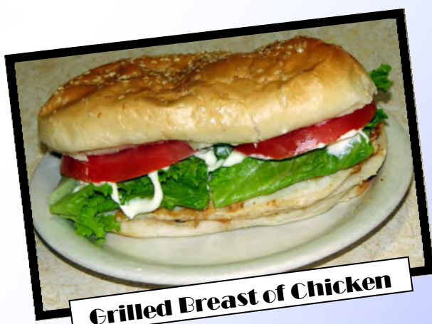
Grilled Breast of Chicken

Lanky Franky · All beef frank served with homemade chili and all the fixings. 2.29 Plain- 1.99 Add cheese .49